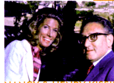
NANCY & HENRY KISSINGER